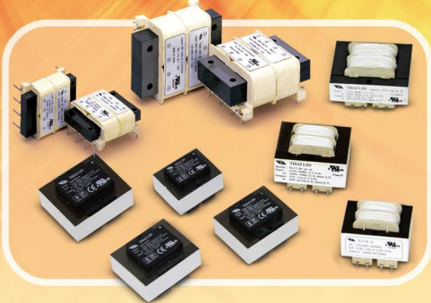
Split bobbin/twin bobbin/PCB plug-in transformers